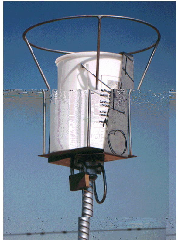
Figure 1: Single bucket monitoring unit, showing sampling bucket with bird ring and security clamp

This project commenced operation in June 2006. Windblown settle-able dust (fall-out) is monitored using the American Society for Testing and Materials standard method for collection and analysis of dustfall (ASTM D1739). This method employs a simple device consisting of a cylindrical 5 L container half-filled with de-ionised water exposed for one calendar month ( 30 \pm 3 days). The water is treated with an inorganic biocide to prevent algal growth in the buckets. The most common reagent used for this is a 5% copper sulphate solution (approximately 1 ml per 3 litres of water bucket).